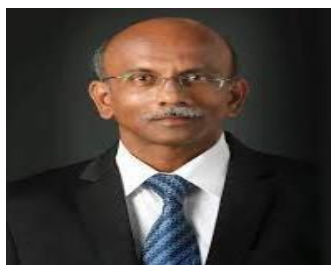
The SARCHITNIS Hon. Adv. Nitin Baburao Thakare