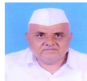
The CHITNIS Hon. Shri. Dilip Sakharam Dalvi