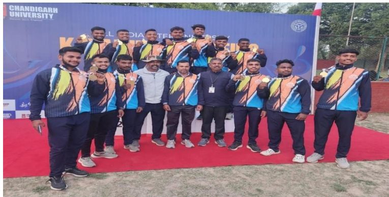
TEAM SPPU PUNE (KAYAKING ) MEDAL WINNER.2024-2025.