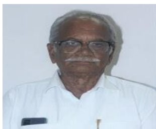
The UPSABHAPATI Hon. Shri. Deoram Baburao Mogal