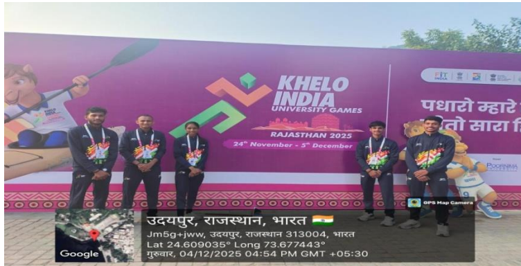
Our College Team Kayaking Securd 4 th Place in Khelo India University Games 2025