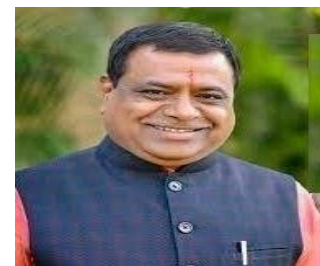
The SABHAPATI Hon. Shri. Balasaheb Ramnath Kshirsagar