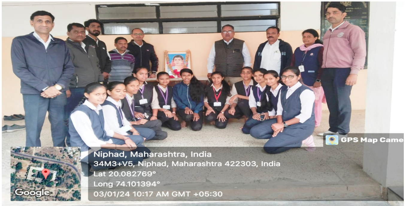
6. Student Counselling cell Report and geotagged photo