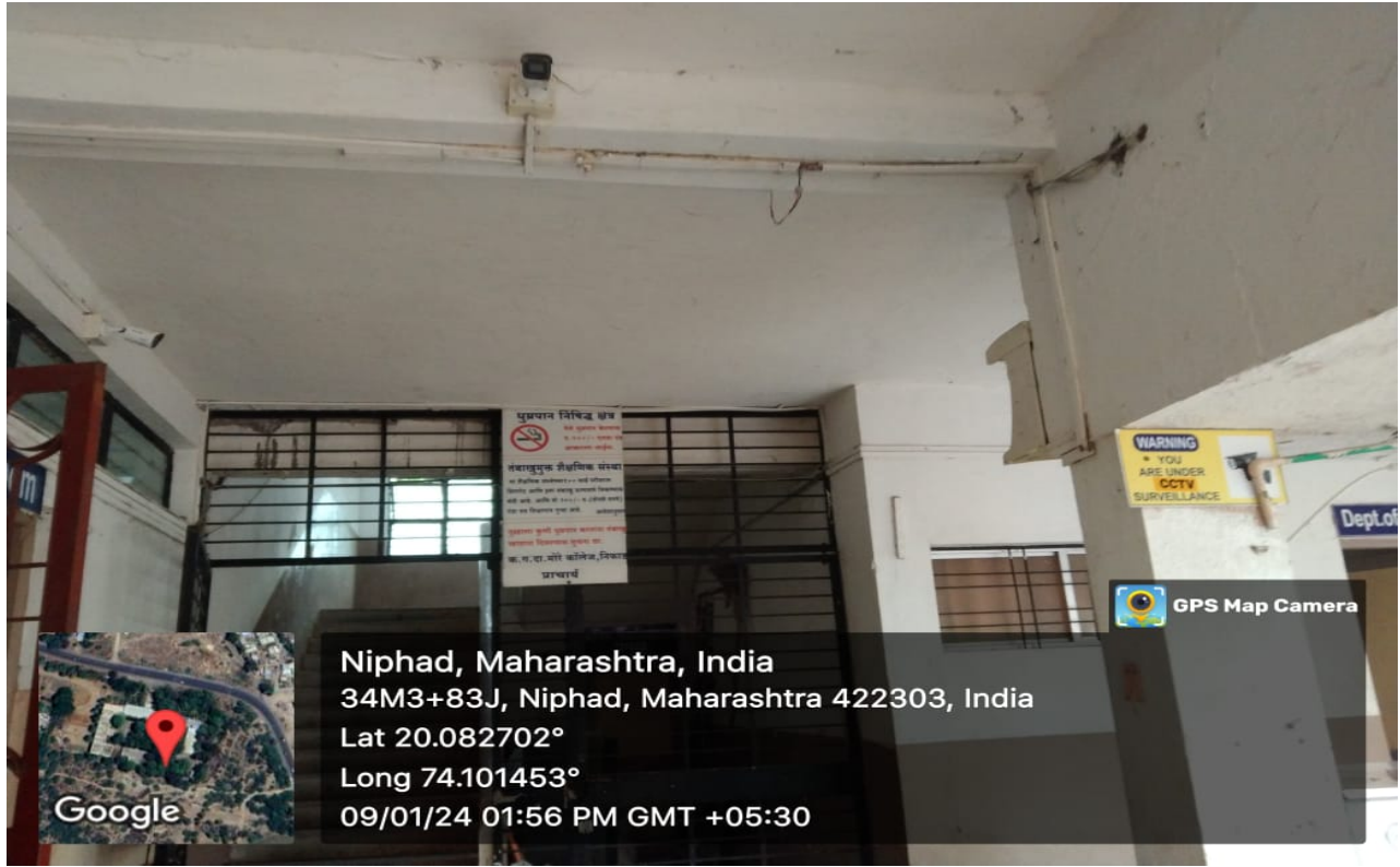
4. VishakhaSamiti board geotagged photo