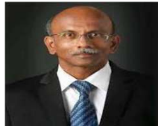
The SARCHITNIS Hon. Adv. Nitin Baburao Thakare