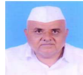
The CHITNIS Hon. Shri. Dilip Sakharam Dalvi