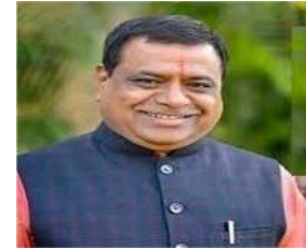
The SABHAPATI Hon. Shri. Balasaheb Ramnath Kshirsagar