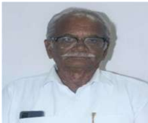
The UPSABHAPATI Hon. Shri. Deoram Baburao Mogal