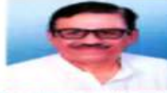
डॉ. मानिकान्तराव नायकांतराव बोरडे सचिव